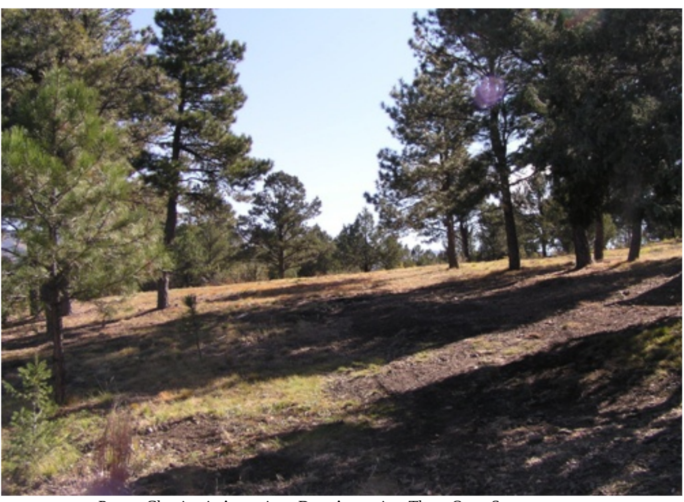
Proper Clearing is Attractive. Deer Appreciate These Open Spaces.

Finally, after years of stalling, we took the first meaningful steps to ensure our safety. We soon had cut down and chipped over 100 trees close to the cabin. That ole yellow belly growing through the roof came crashing down as well. Not only had it started bumping into the frame of the porch during frequent high winds, but having it stick up through the roof was a wildfire magnet. The entrance road I had agonized over now passes through a properly cleared meadow leaving the tall ponderosas in place.